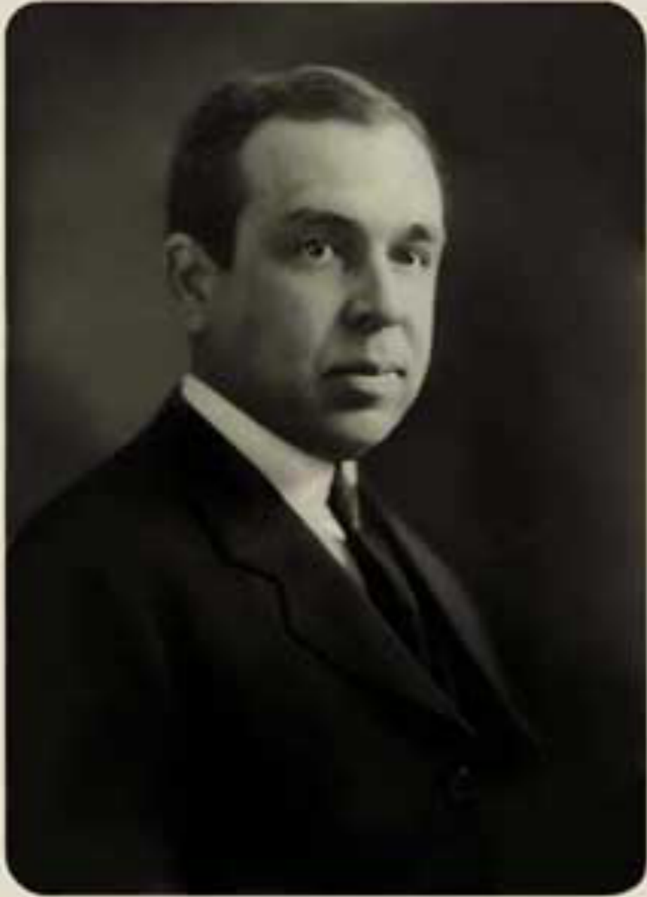
J. Gresham Machen